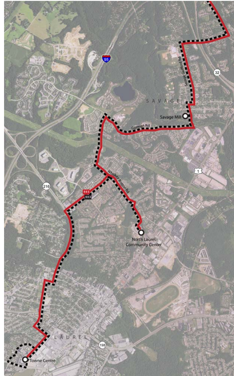
Existing Route 503 Proposed Route 503 Proposed Route 407 Key Time Point